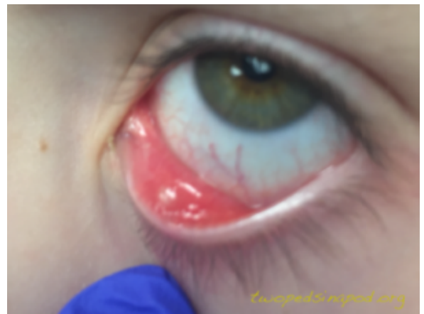
stye: the view from the inside

Insect bites may also masquerade as styes. However, insect bites are itchy rather than painful.