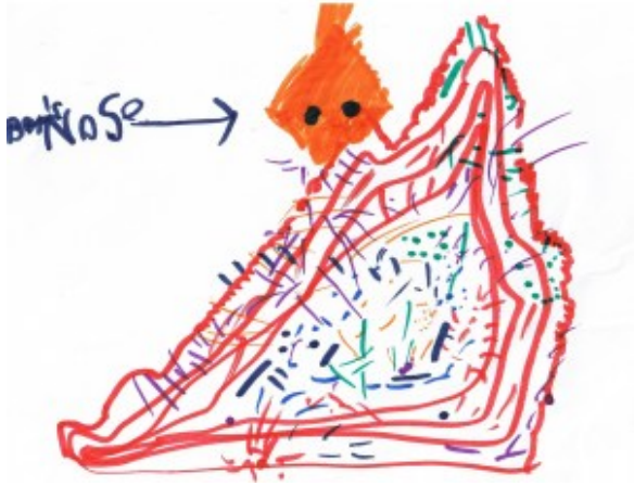
Ben's runny nose, as depicted by Ben

The good news is that there was only a smattering of influenza (flu) cases across the United States over the summer. The great news is that according to the Centers for Disease Control, most of the detected strains are covered in this year's vaccine.