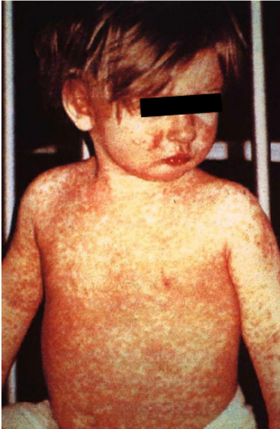
A typical measles rash

Who knew when we first published this post in June 2014 that another measles outbreak would occur in the US. In light of the numerous measles cases that emerged out of the California Disneyland exposure, we re-publish signs of measles in children. Parents who have children who are not completely