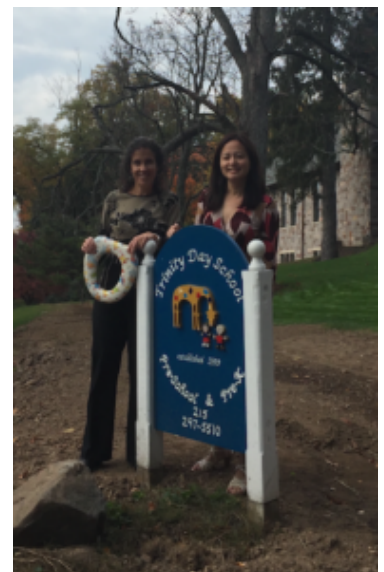
At Trinity day

A shout out to Trinity Day School in Solebury, PA where we spoke with a group of parents yesterday about the pearls and pitfalls of potty training. Today we share some of what we discussed.