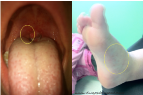
The mouth ulcers and foot rash of Hand Foot Mouth